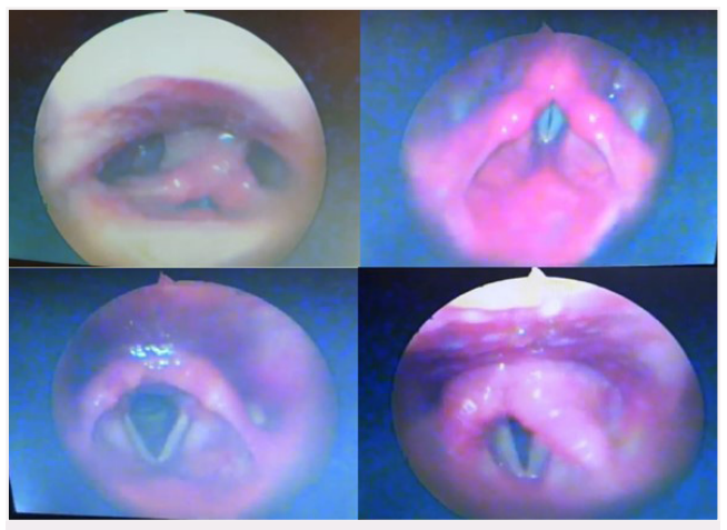
Figure 3. Findings in 70° direct laryngoscopy suggestive of laryngopharyngeal reflux disease